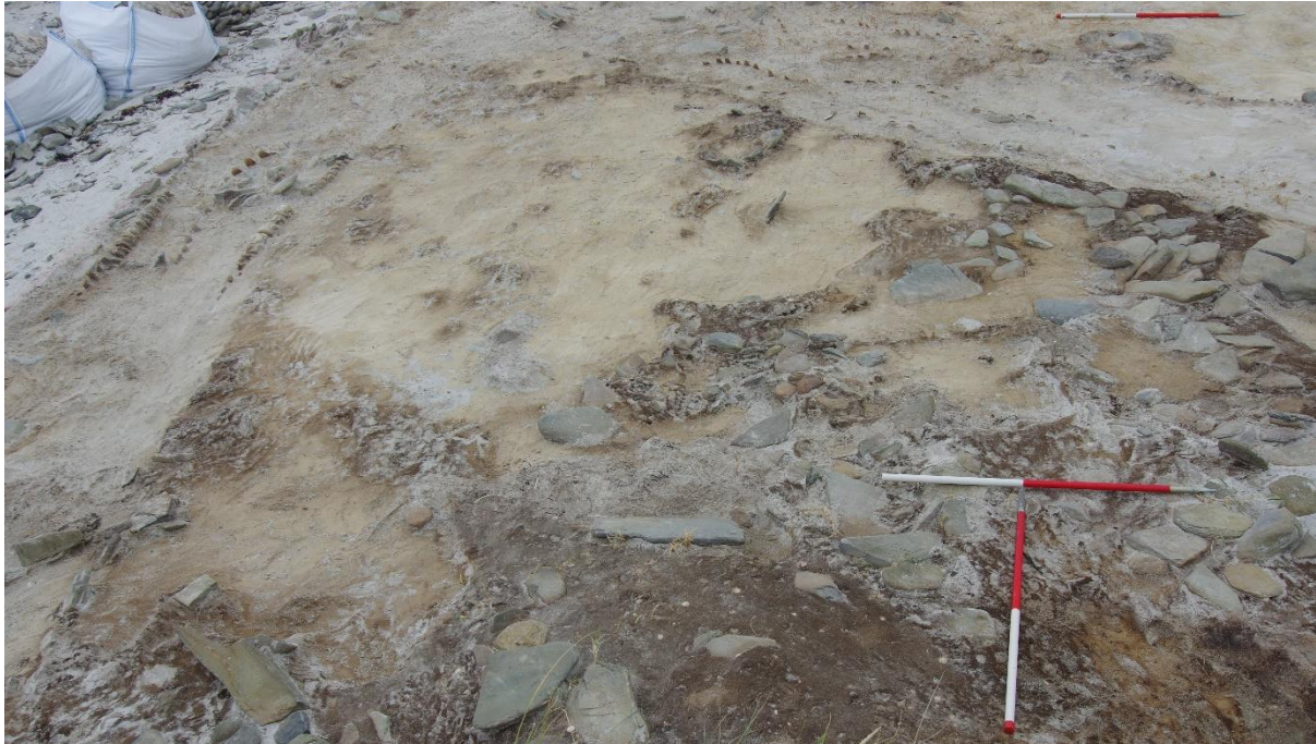
Figure 13. The whale pits (left and top) at Cata Sand with the tops of whale vertebrae sticking out of the sand

whale remains had been placed in the cut two-deep and as they had decomposed some of the remains of some individuals closely overlay those of others. Those higher up were better preserved than those lower down which were affected by high tide and had started to rot. In amongst the fill were modern finds including iron objects (SF104, 105) and glass (SF112).