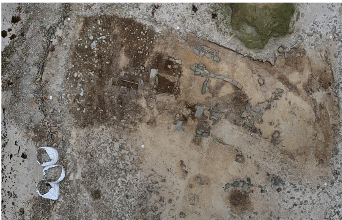
Figure 3. Vertical shot of the trench at Cata Sand showing the early Neolithic house and the two later cuts filled with whale bone

We opened an area which incorporated the area of magnetic enhancement identified by the geophysical survey. We did not remove any standing dune. Once the archaeology was exposed we then targeted specific areas for excavation. We removed any windblown sand by hand to ensure we were not removing any archaeological contexts. All contexts and features were then excavated by trowel and hand shovel and fully recorded (plans/sections, photographs and single context recording). We dry sieved all contexts. We kept the spoil from 100% of cut features for wet sieving, 10% of other contexts were also retained for wet sieving, following English Heritage guidelines on good practice in environmental archaeology (Campbell et al. 2001). All finds were retained and recorded in three dimensions using a GPS total station. Unworked animal bones were kept by context apart from the whale skeletons which were excavated and extracted as individuals (see below). At the end of the excavation the site was returned to the condition it was found prior to excavation.