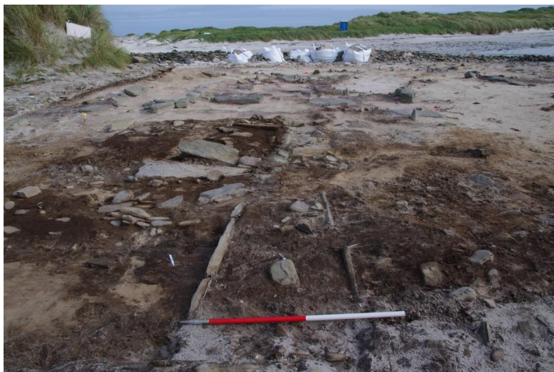
Figure 8. Western hearth (032) looking east into the house and surrounded by dark brown occupation layers

The central hearth (fill 100) was clearly later, but there were also two hearths which appeared to be earlier. One was exposed in our 2016 investigations (004) and was well-preserved. However, we did not expect to find another hearth to the west of the site, but here another large and well-preserved hearth survives (032; see Figure 8). Both of these hearths are surrounded by occupation layers which butt up against the hearth stones. We left the occupation around the western hearth intact (028) and did not investigate this area any further this season, although there were a number of small finds, mainly flint, on the surface of 028 (SF107, 128-138, 141, 175). We concentrated our efforts instead on hearth 004 and its surrounding occupation layers. In places the occupation was patchy but in other areas, especially around the hearth, it was thickly deposited – we could not demonstrate any stratigraphic differences between the patches and main occupation spread so this is now considered part of one context (084). The interior of the house was gridded into metre squares and 084 excavated using this grid. Those squares around the wall (008) were the most vulnerable and were removed first. Those around the hearth were left in situ to be excavated next year (because they support the hearth stones). The occupation produced some small finds including pottery (SF160) and stone tools (SF172, 174). The hearth itself was also half-sectioned (fill 068, and see Figure 9).