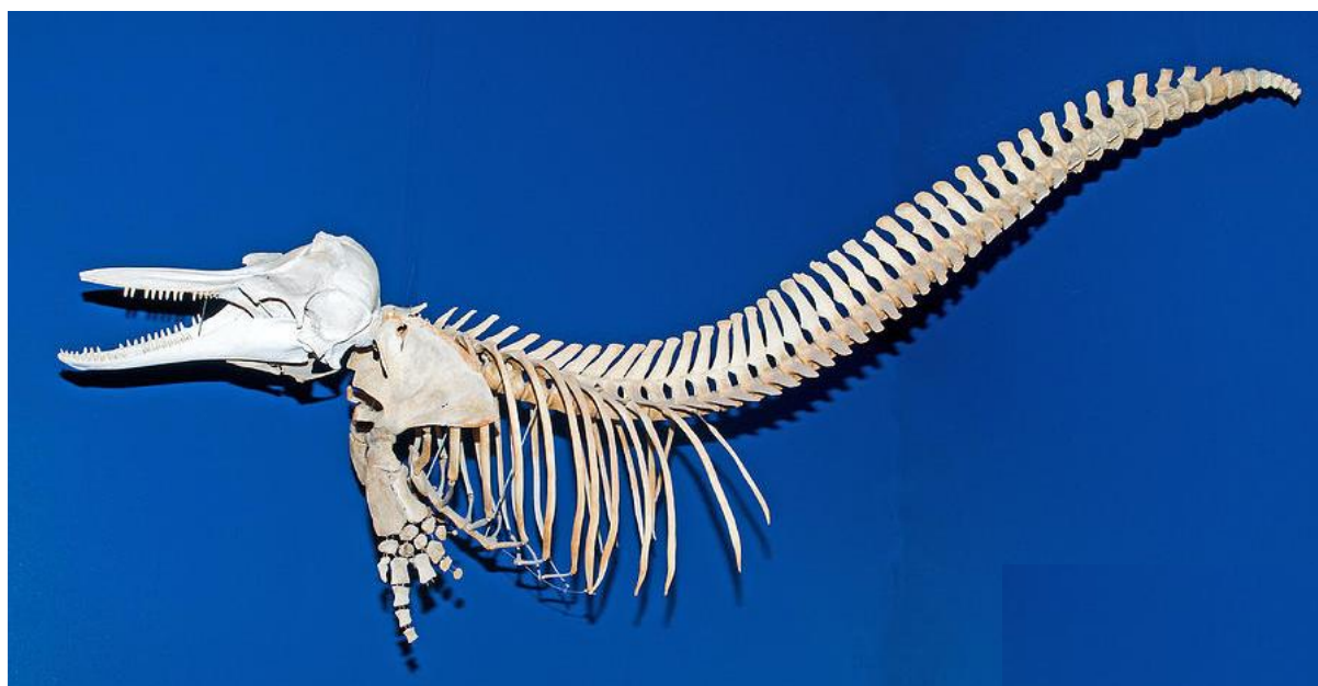
Figure 15. Complete skeleton of a bottlenose. We recovered all components bar the skull

This account might well be a document of the whales we excavating, and the smell from them may also indicate why they had been disposed of in shallow pits. Certainly the tide at Cata Sand is not strong enough for the whales to be disposed of at sea, and the presence of the large sand dune immediately to the east presumably meant the digging of a quick pit was preferable to hauling smelly and decomposing bodies over a sand dune. This evidence would also be in-keeping with the lack of skulls on site, which in modern times were removed and given to the admiralty.