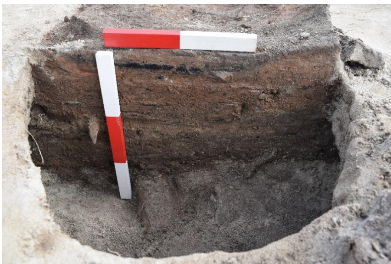
Figure 10. Section through pit [128] showing deposits of ashy material (113)

The occupation layer 084 peeled off onto clean sand in most places, demonstrating the house was built on sand. In one place, however, a feature was found underneath 084. This was a roughly circular pit cut into the sand [128]. It contained two fills (113a and 113b) and may be the deposition of two deposits, or, possibly, a recut feature. Its position underneath the main occupation layer indicates it is primary.