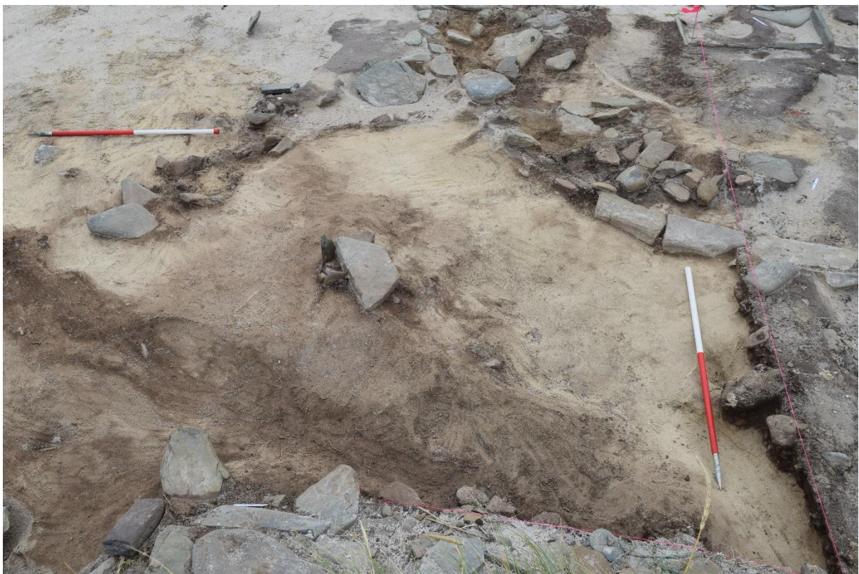
Figure 6. The north-eastern extent of the early Neolithic house wall after the later midden (003) had been removed. It is possible to make out sand blown up against the now-robbed out wall. The line of stones to the left of the picture is most likely a drain