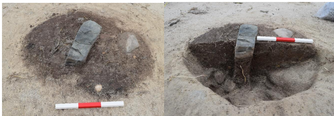
Figure 11. Feature 051 in plan (left) and half-sectioned (right)

Feature cut 051. This feature was roughly circular when first exposed and contained a single homogenous fill (052). The fill was dark ashy midden material with charcoal flecks and containing four small finds (a flint flake and three Skaill knives SF120-123).