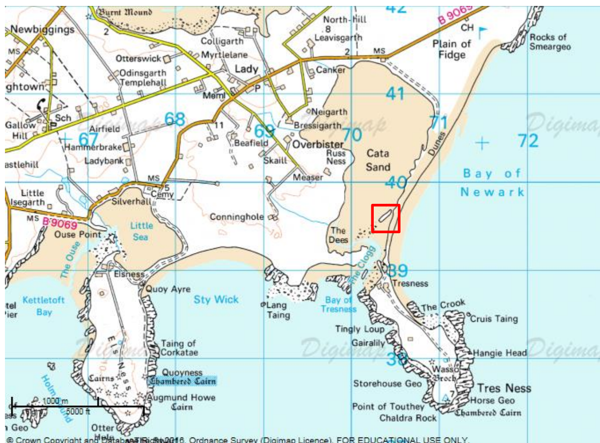
Figure 1. The location of Cata Sand, Sanday, Orkney. The Grithies Dune is highlighted in red

On the eastern side of Cata Sand, Sanday, a small sand dune known as the Grithies Dune is located in the intertidal zone (grid reference: HY 704 397: Figure 1). In December 2015 we identified archaeological material eroding out of the sand immediately to the south of the Grithies Dune. We returned in March 2016 to undertake an evaluation. We opened up a small trench roughly 8 x 5m over an area where we had previously seen archaeological deposits. The work involved the removal of windblown sand only rather than the excavation of any of the archaeological layers revealed. This simple cleaning exercise, however, produced 41 artefacts including flint debitage, Skailt knives, coarse stone tools and pottery. The evaluation revealed that the remains of occupation, including a house, lay exposed just beneath windblown sand. In order to ascertain the extent of the occupation here we then conducted a large-scale geophysical survey of the area using magnetometry. This revealed an area of magnetic enhancement around the Grithies Dune roughly 20m in diameter (Figure 2). We returned for a four week period in 2017 to excavate the archaeological remains concentrated at the Grithies Dune site.