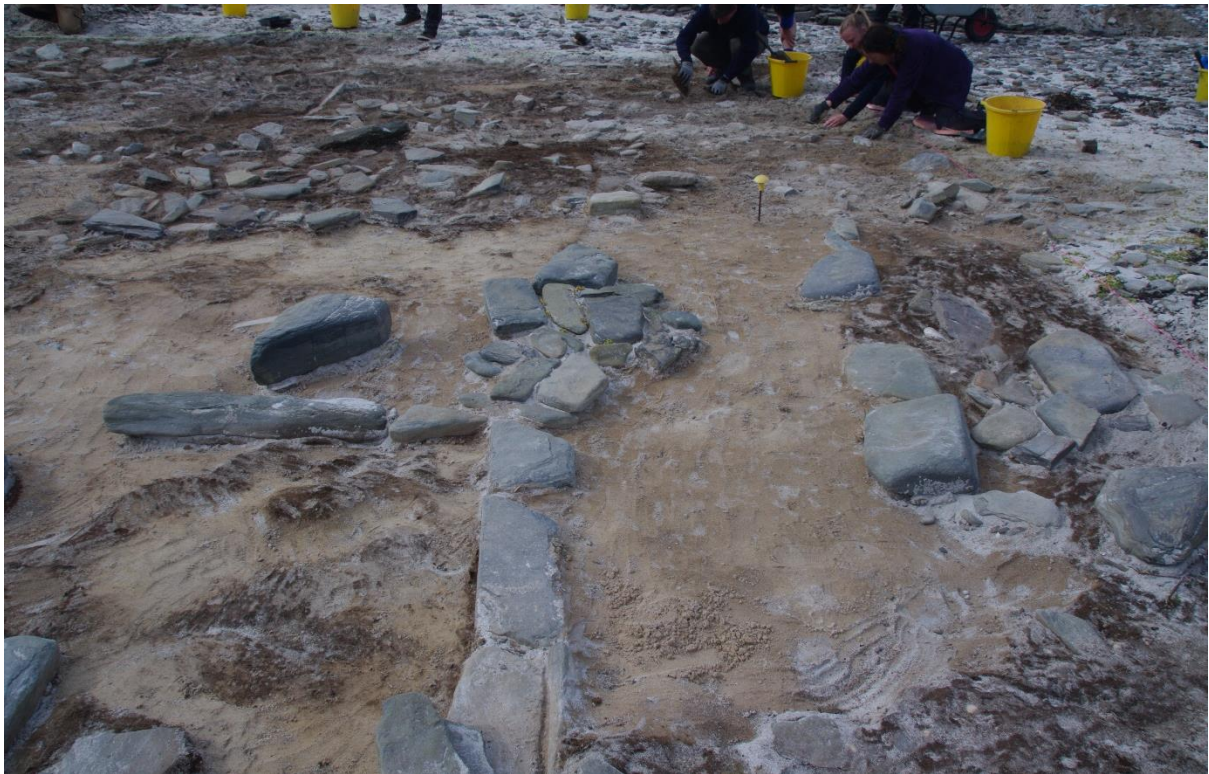
Figure 5. Walling on the northern side of the house. Outer wall to the right (009), inner-facing wall in the middle (008) and a partition stone (066) visible to the left