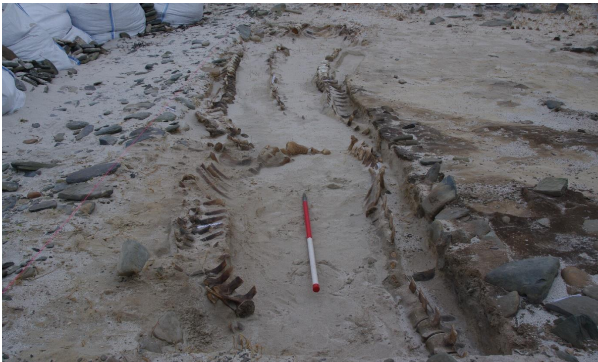
Figure 14. Upper layer of whale carcasses representing the remains of multiple whales