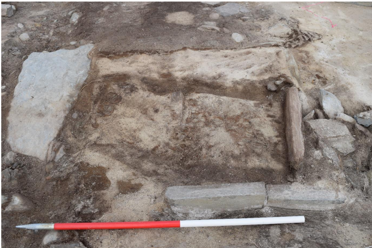
Figure 7. Central hearth found under the 'pier' (071) after the hearth fill had been removed (view looking north). One slab (099) remained in place (right) while only the outlines of the others could be seen

Within the house there were a number of features including hearths and deposits including occupation layers. In many places, where investigated, it was not always possible to demonstrate the stratigraphic sequence of these different elements. This is because of differential weathering and erosion processes at work on a site built on sand. Potentially one of the last structural components of the site was a rectangular block of stones abutting the inner wall face (071). This was described as a 'pier' due to similarities with a similar feature at the Braes of Ha'Breck on Wyre. Whether it was the remains of an internal division, a later structural feature creating a raised platform within the house or simply a dump of stone is not clear. However, upon removal it cleaned down to reveal the remains of a hearth. One hearth stone remained in place (099) but the others had been removed although the cuts in which they once stood were clearly visible [118, 120]. Two stones on the south side might be displaced hearth stones (128).