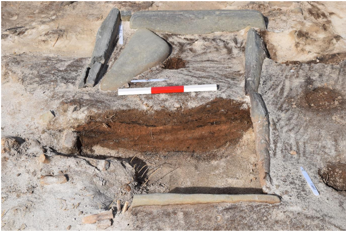
Figure 9. Hearth 004 half-sectioned (fill 068) looking west. The whale pit cuts into one side of the hearth (bottom left) and occupation (084) can be seen abutting the right hearth stone

The occupation layer 084 peeled off onto clean sand in most places, demonstrating the house was built on sand. In one place, however, a feature was found underneath 084. This was a roughly circular pit cut into the sand [128]. It contained two fills (113a and 113b) and may be the deposition of two deposits, or, possibly, a recut feature. Its position underneath the main occupation layer indicates it is primary.