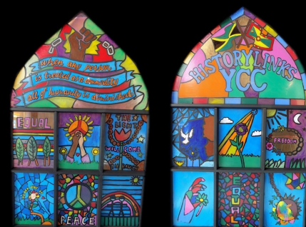
Stained glass window designs produced by the Young Curators Club, Dornoch